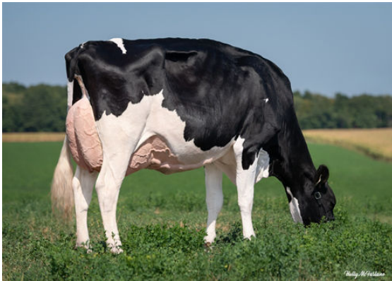
PROGENESIS HIGHJUMP LEADER DAM