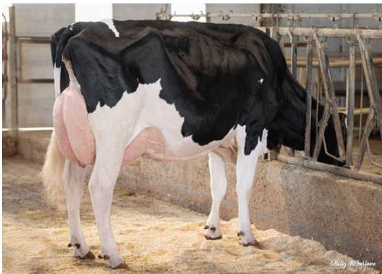
PROGENESIS HIGHJUMP LEADER DAM