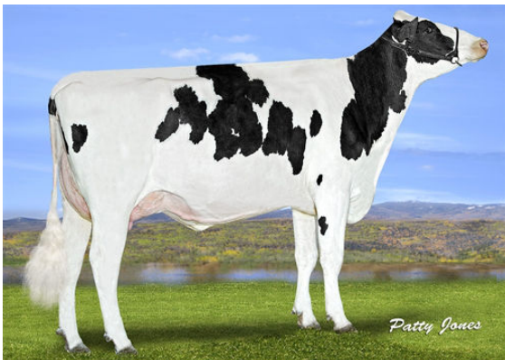
PROGENESIS MONTANA BEAUVAIS THIRD DAM