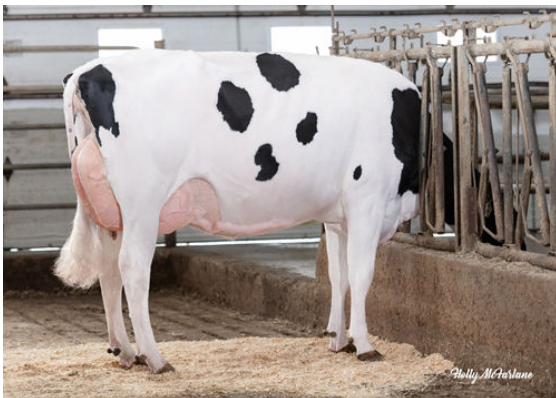
PROGENESIS EINSTEIN WIMZY DAUGHTER

Proof Source - AHDB & Holstein UK. Semex UK abides by the AHDB Dairy and Holstein UK established Code of Advertising. Immunity indices: Semex Alliance. Methane Efficiency: Lactanet