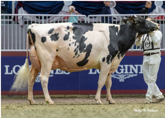
BIRKENTREE SIDEKICK ELLISSIA DAUGHTER

Proof Source - AHDB & Holstein UK. Semex UK abides by the AHDB Dairy and Holstein UK established Code of Advertising. Immunity indices: Semex Alliance. Methane Efficiency: Lactanet