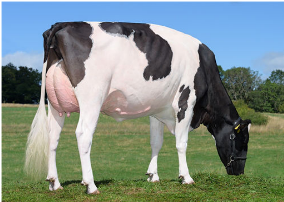
PTIT COEUR SIDEKICK DANCING DAUGHTER