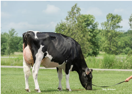
LOCUS LANE BONNIE BARDO