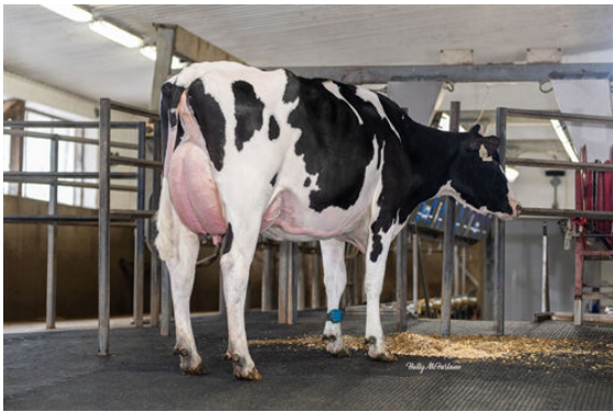
ATHLONE BARDO MOLASSES