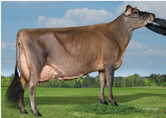
SUNNY HILL NOTEPAD ARMADILLO DAM