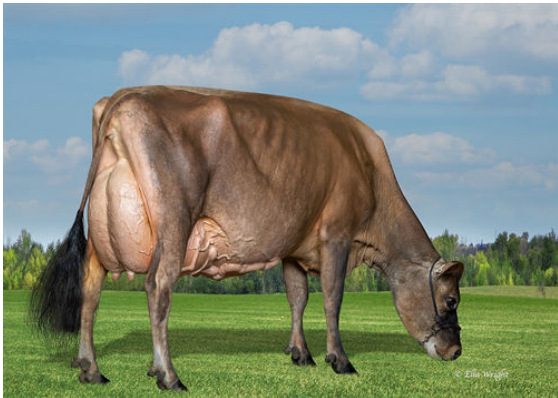
SUNNY HILL NOTEPAD ARMADILLO DAM