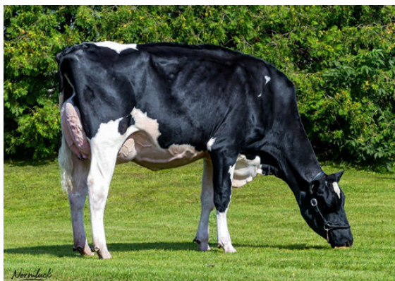
COMESTAR LATINET PERFECT DAM