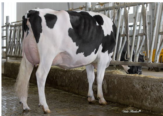
COMESTAR LATASHA TROPIC GRANDDAM