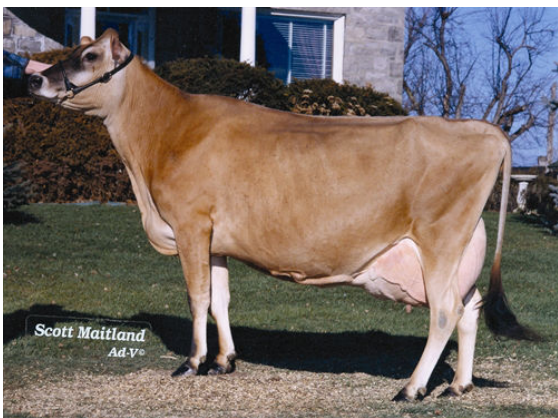
BILLINGS BERRETTA DOROTHY FOURTH DAM