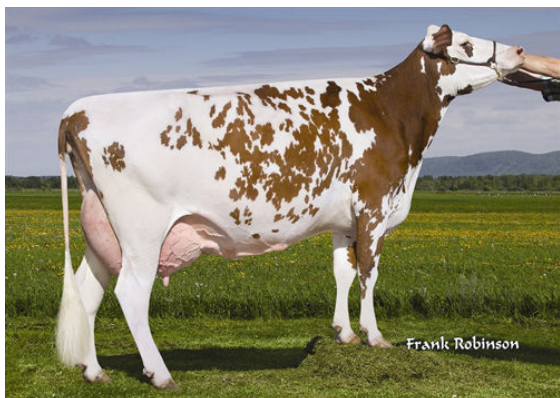
DES FLEURS POKER PARTENAIRE FIFTH DAM