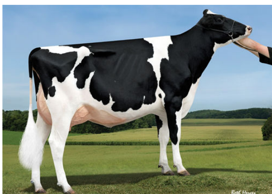
SANDY-VALLEY BL PARADISE