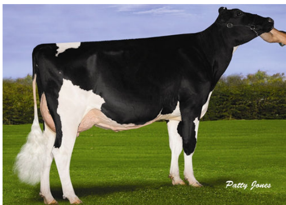
SANDY-VALLEY ATWD BRADY FIFTH DAM