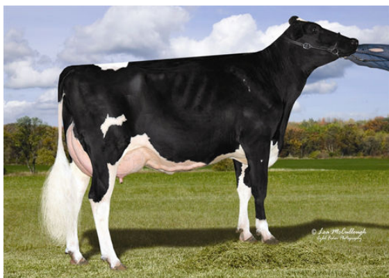
COOKIECUTTER MOM HALO FIFTH DAM