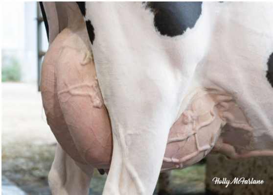
BRANDT-VIEW ACHIEVER ARAXIE DAM