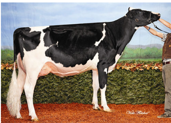
RALMA-RH MANOMAN BANJO FIFTH DAM