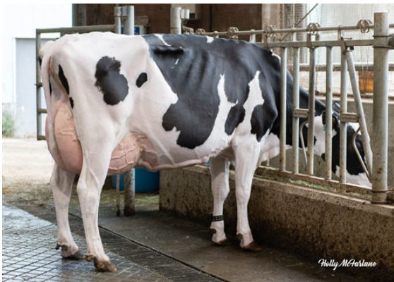
BRANDT-VIEW ACHIEVER ARAXIE DAM