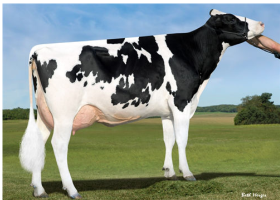
SANDY-VALLEY MORGAN ERA THIRD DAM