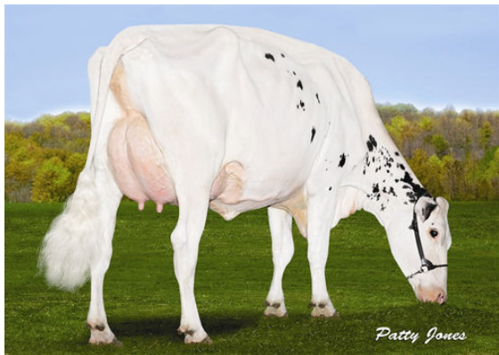
VELTHUIS SG SNOW EVENT