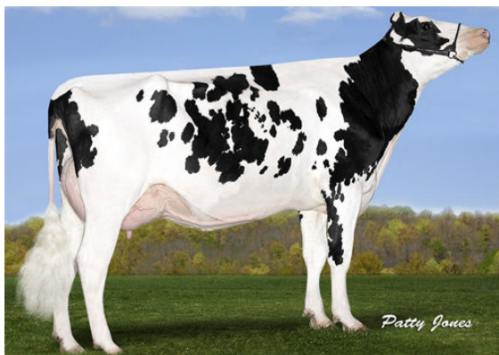
SILVERRIDGE V MUNITION EARWIG