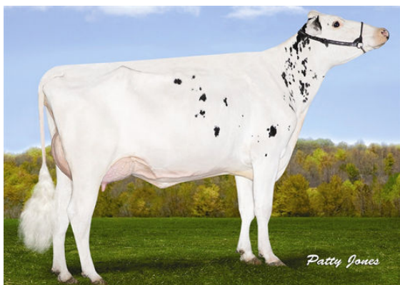
VELTHUIS SG SNOW EVENT