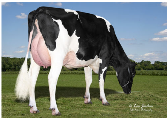
AOT ZASBERILLA HAKE DAUGHTER