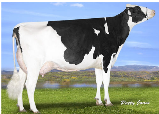
OCD DELTA MISSY