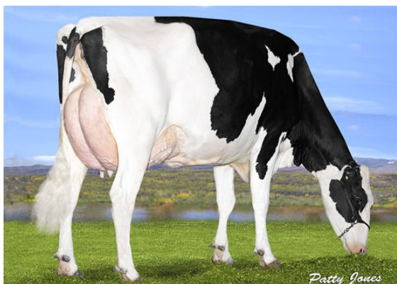
OCD DELTA MISSY