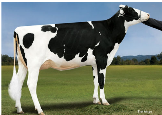
PROGENESIS MODESTY MISSILE