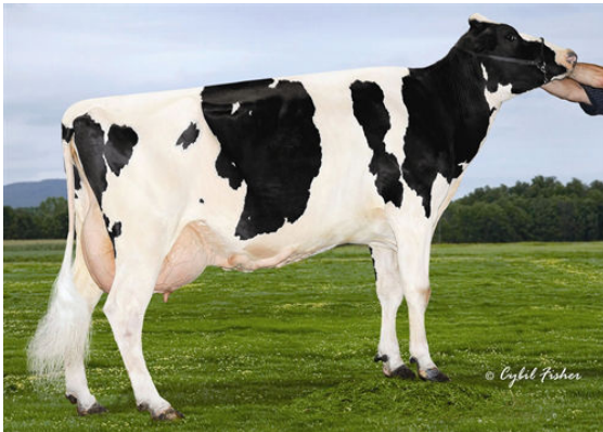
CLEAR-ECHO 822 LAUD 1266 FOURTH DAM