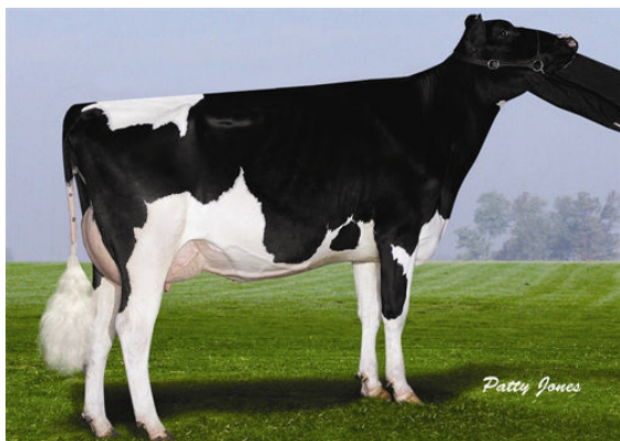
WHITTIER-FARMS HE REBECA FOURTH DAM