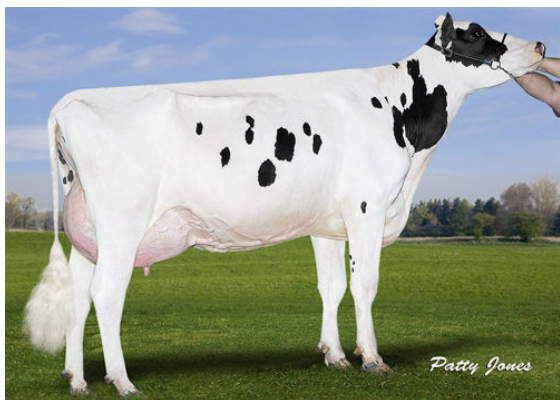
FARNEAR-TBR-BH VIS VASE