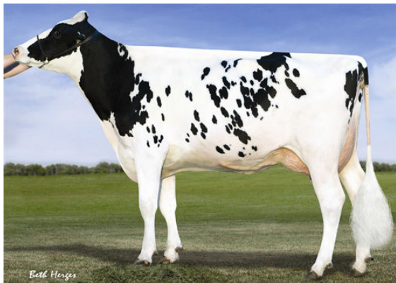
VISION-GEN SH SHO A12037