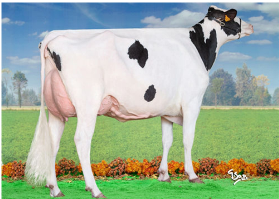
TOC-FARM 1ST GRADE FIORE GRANDDAM