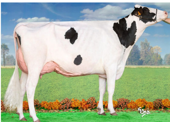
TOC-FARM 1ST GRADE FIORE GRANDDAM