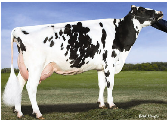
REGANCREST M BENISHA FIFTH DAM