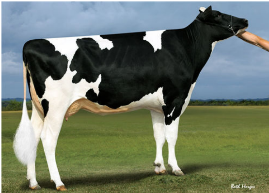
REGANCREST JS BETSIE GRANDDAM