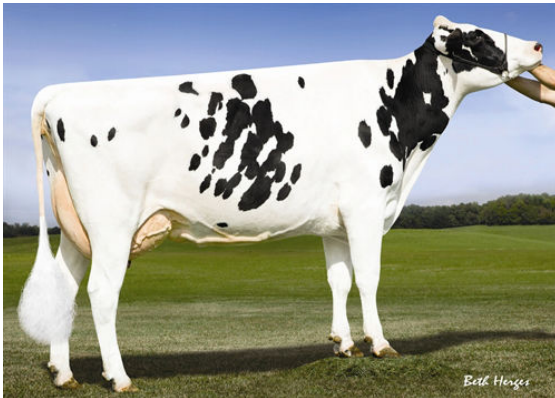
REGANCREST DORCY BENISHEY FOURTH DAM