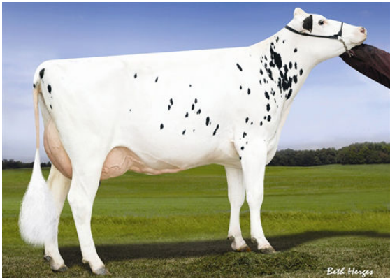
RICHMOND-FD LORELEI Dam