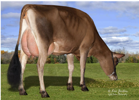
JX GENERATIONS JAMMER DORA {5} FOURTH DAM