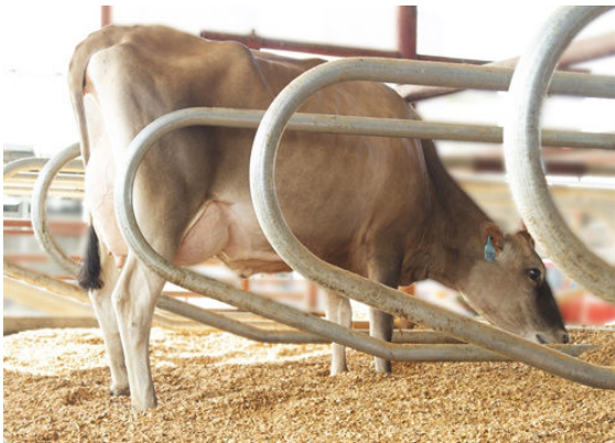
PROGENESIS BNCROFT DEJA GRANDDAM