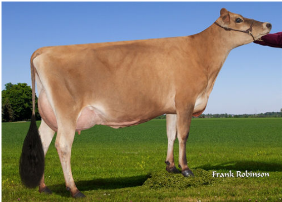
PROGENESIS DUCHESS DAM