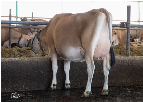
LENCREST CASPIAN QUEENSLAND DAUGHTER