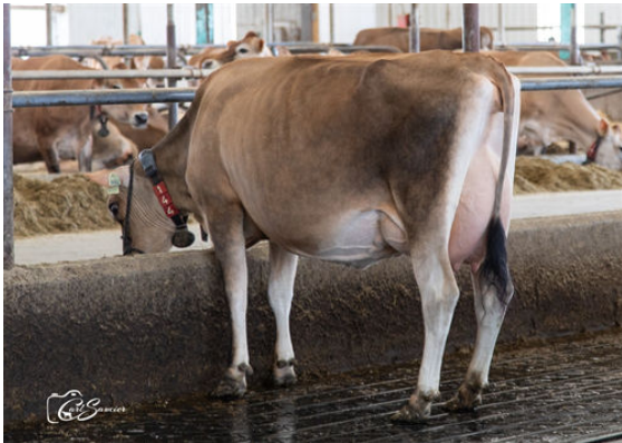
LENCREST CASPIAN ROSE DAUGHTER