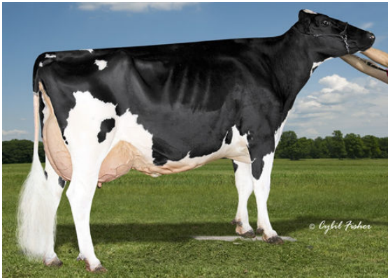
KINGS-RANSOM DM DEBONAIR FIFTH DAM