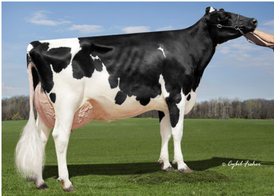
KINGS-RANSOM DELTA DESTINY FOURTH DAM