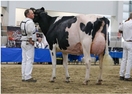
FRAELAND DOORMAN BOURBON GRANDDAM