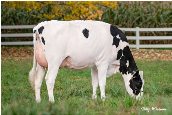
FRAELAND ALLIGATOR BOMBAY DAM