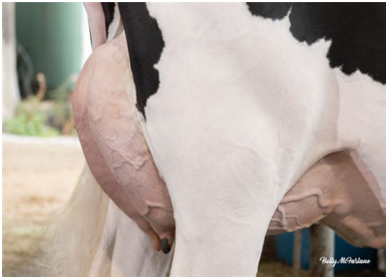
COOKIECUTTER FANCA HOCCO DAM