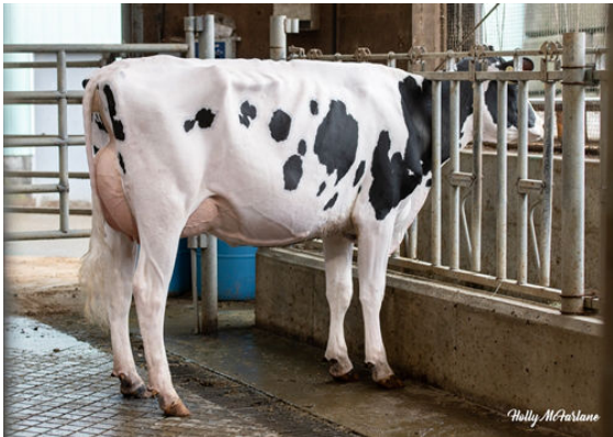
PROGENESIS HIGHJUMP POPCORN GRANDDAM