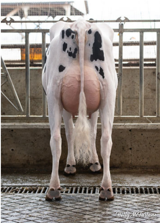
PROGENESIS HIGHJUMP POPCORN GRANDDAM