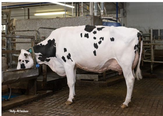
FLEURY SALVATORE ECLAIR GRANDDAM