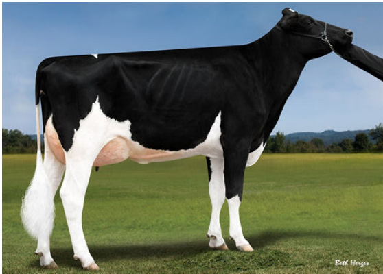
PROGENESIS MONTANA GALATEA FOURTH DAM