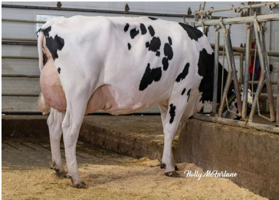
PROGENESIS JEDI MENACE FOURTH DAM