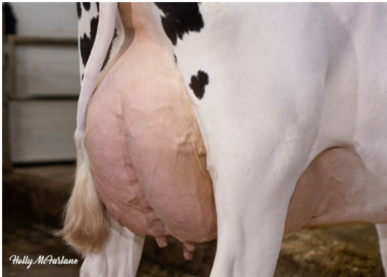
PROGENESIS JEDI MENACE FOURTH DAM