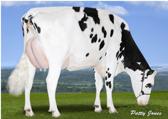
PEAK BOMBERO MAXIMA FIFTH DAM