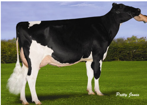
SANDY-VALLEY ATWD BRADY FIFTH DAM