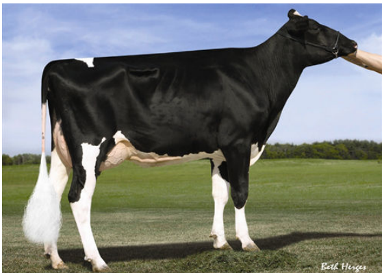
CO-VISTA ATWOOD DESIRE FOURTH DAM