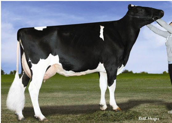
SCIENTIFIC DELUXE RAE-ETS FIFTH DAM