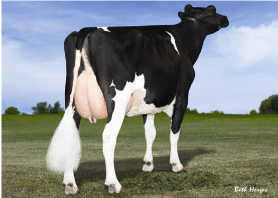
SCIENTIFIC DELUXE RAE-ETS FIFTH DAM