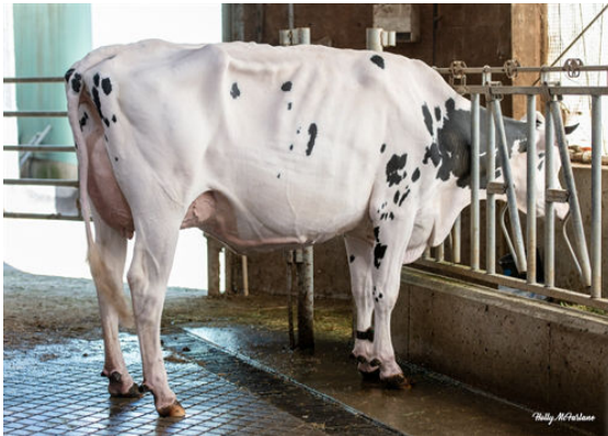
PROGENESIS BOMBA PARAGON DAM