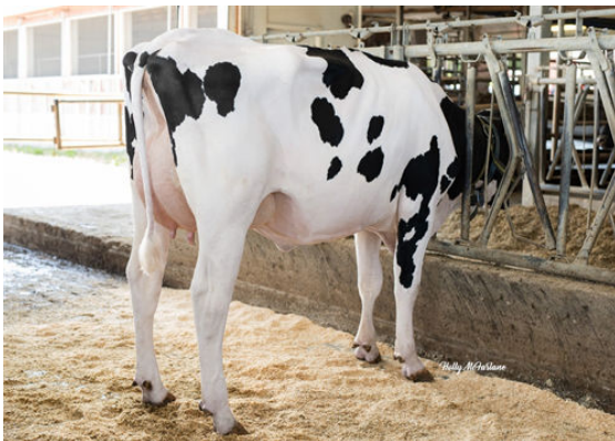
PROGENESIS FABULOUS PEARL GRANDDAM