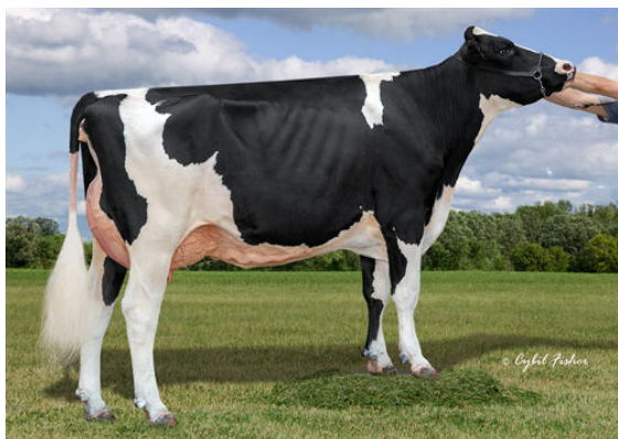
AOT POSITIVE HALLMARK DAM