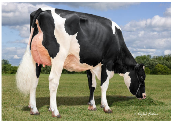
AOT POSITIVE HALLMARK DAM