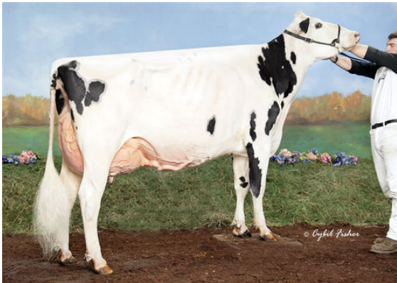
KINGS-RANSOM KB DELICATE THIRD DAM