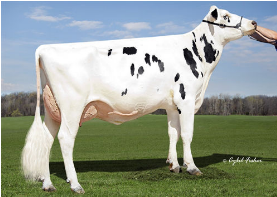
KINGS-RANSOM DELICIOUS GRANDDAM