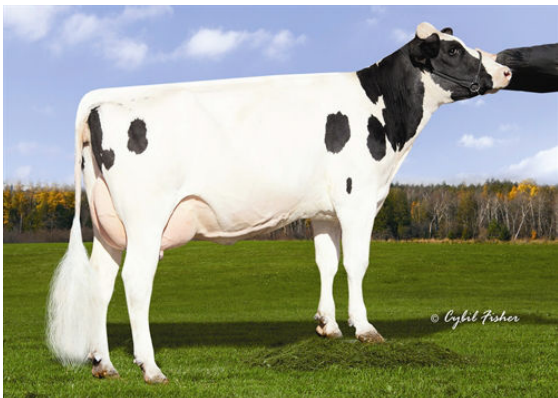
KINGS-RANSOM IT DISTINCT FOURTH DAM