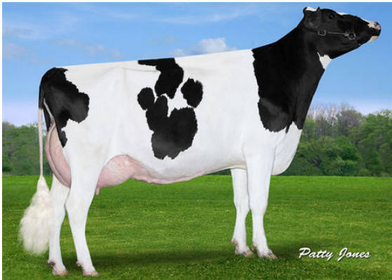
VIEW-HOME MCC FOUND FOURTH DAM