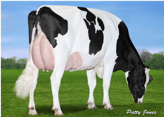
VIEW-HOME MCC FOUND FOURTH DAM