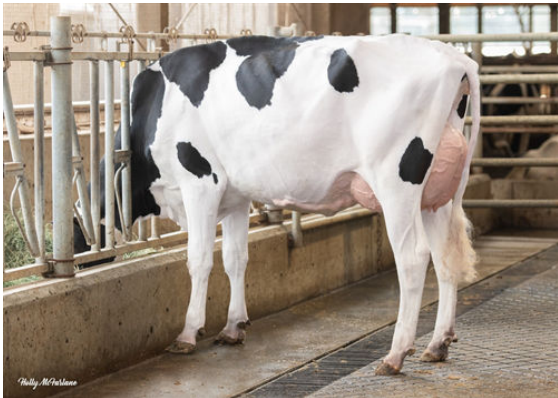
PROGENESIS FELLOWSHIP PUDDLES DAUGHTER