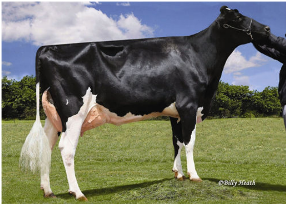
LADYS-MANOR ALLANAS DORA FIFTH DAM