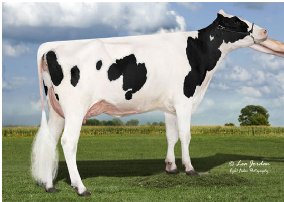
SCENERY-VIEW CRYSTAL GRANDDAM