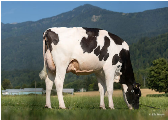
PROGENESIS FABULOUS PECAN DAM