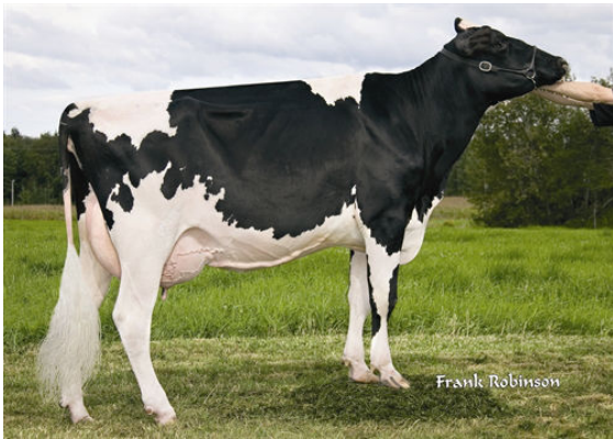
GEN-I-BEQ CHAMPION BAMBI FIFTH DAM