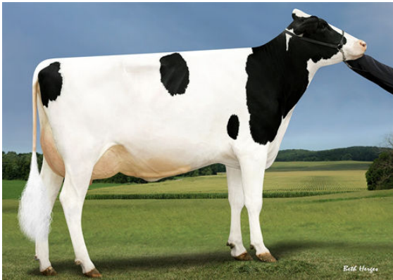
SANDY-VALLEY MD PLEASURE GRANDDAM