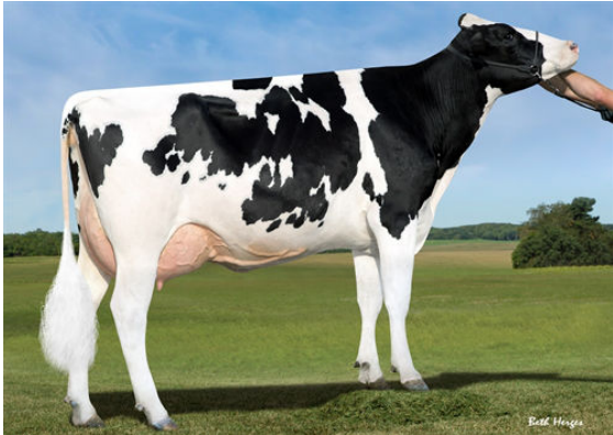
SANDY-VALLEY MORGAN ERA THIRD DAM