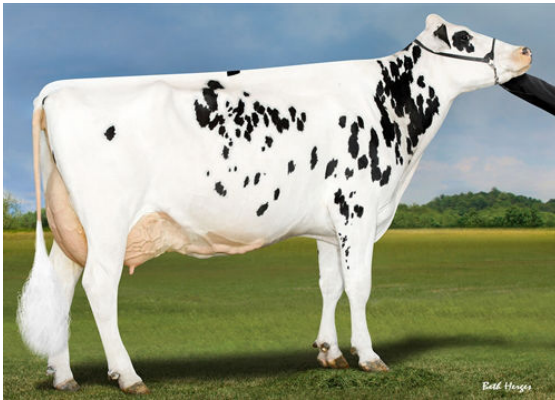
BOMAZ DELTA 6790 GRANDDAM