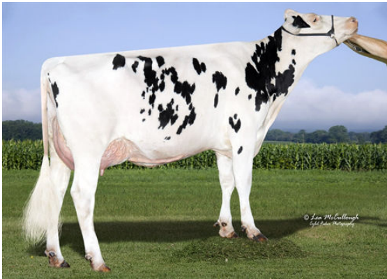
BOMAZ NUMERO UNO 5904 THIRD DAM