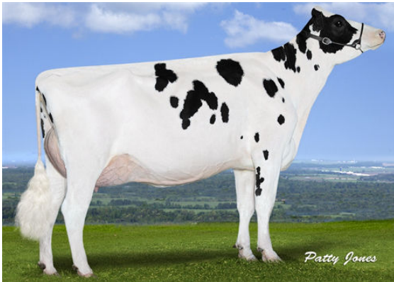
EDG DAHLIA MOGUL 2257 FOURTH DAM