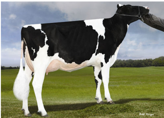
LADYS-MANOR S DAHLIA FIFTH DAM