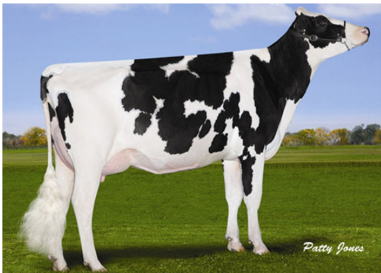
GEN-I-BEQ SNOWMAN SUMMER THIRD DAM