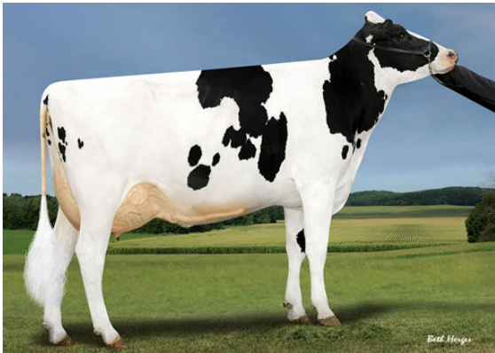
SANDY-VALLEY SLV ESSENCE GRANDDAM