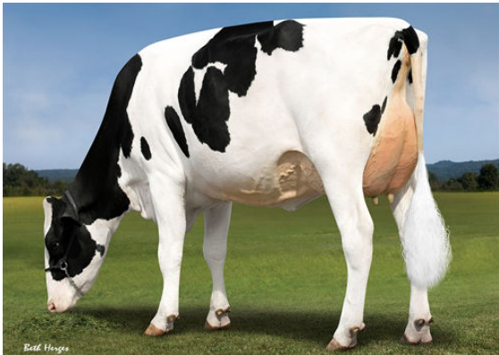
PROGENESIS DUKE MOLDAVITE GRANDDAM